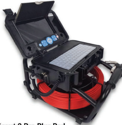
Scout 3 Pro Plus Red