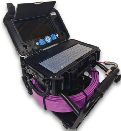
Scout 3 Pro Plus Purple