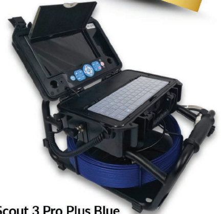
Scout 3 Pro Plus Blue